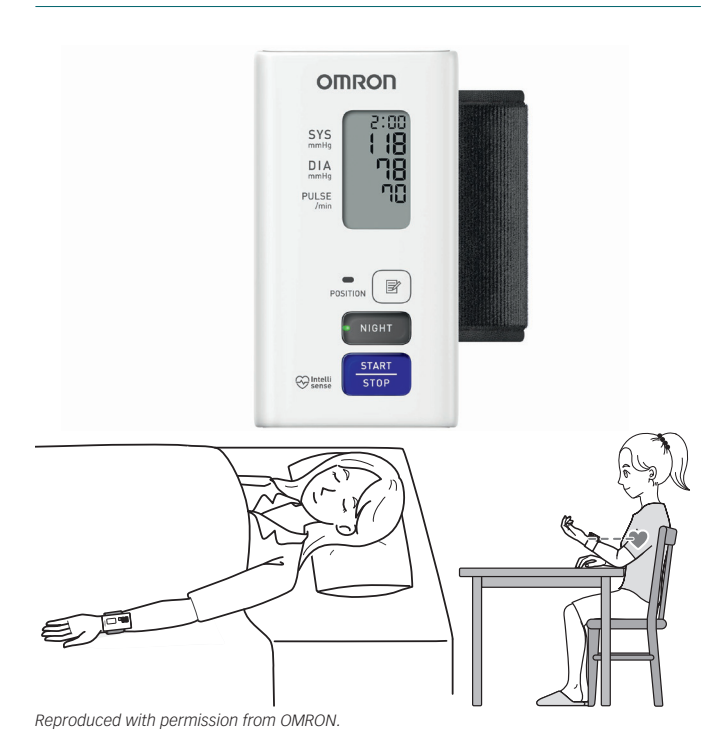
Figure 2: The NightView Blood Pressure Monitor

sitting and in supine position (with palm placed sideways, upwards and downwards), according to the ANSI/AAMI/ISO81060-2:201 protocol and has passed all criteria.<sup>68,69</sup> A comparison with ABPM in 85 subjects found similar results in office and out of office.<sup>68,69</sup> This improved possibility to detect masked nocturnal hypertension will allow optimisation of BP-lowering medication, with the ultimate goal of optimising the achievement of BP target values and reduce CV events.